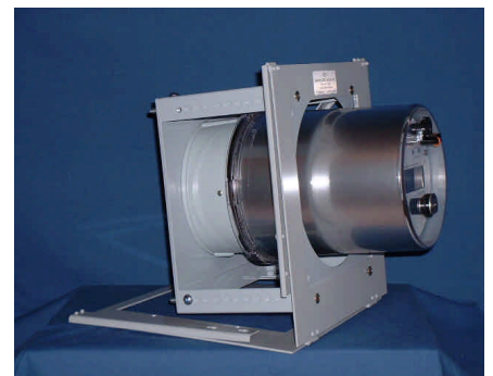
Fully Retracted in Demo Panel