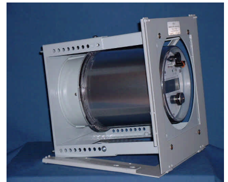
Fully Expanded in Demo Panel