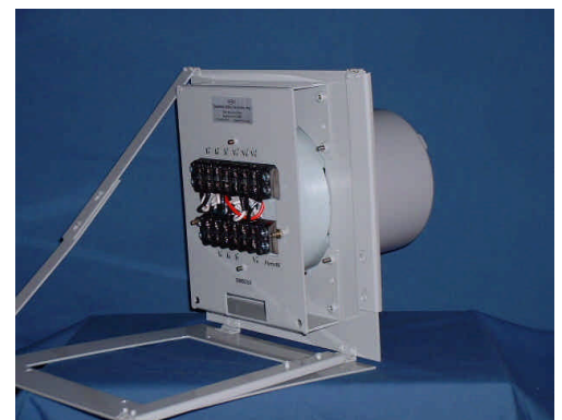
New Surface Mount Panel Adapter